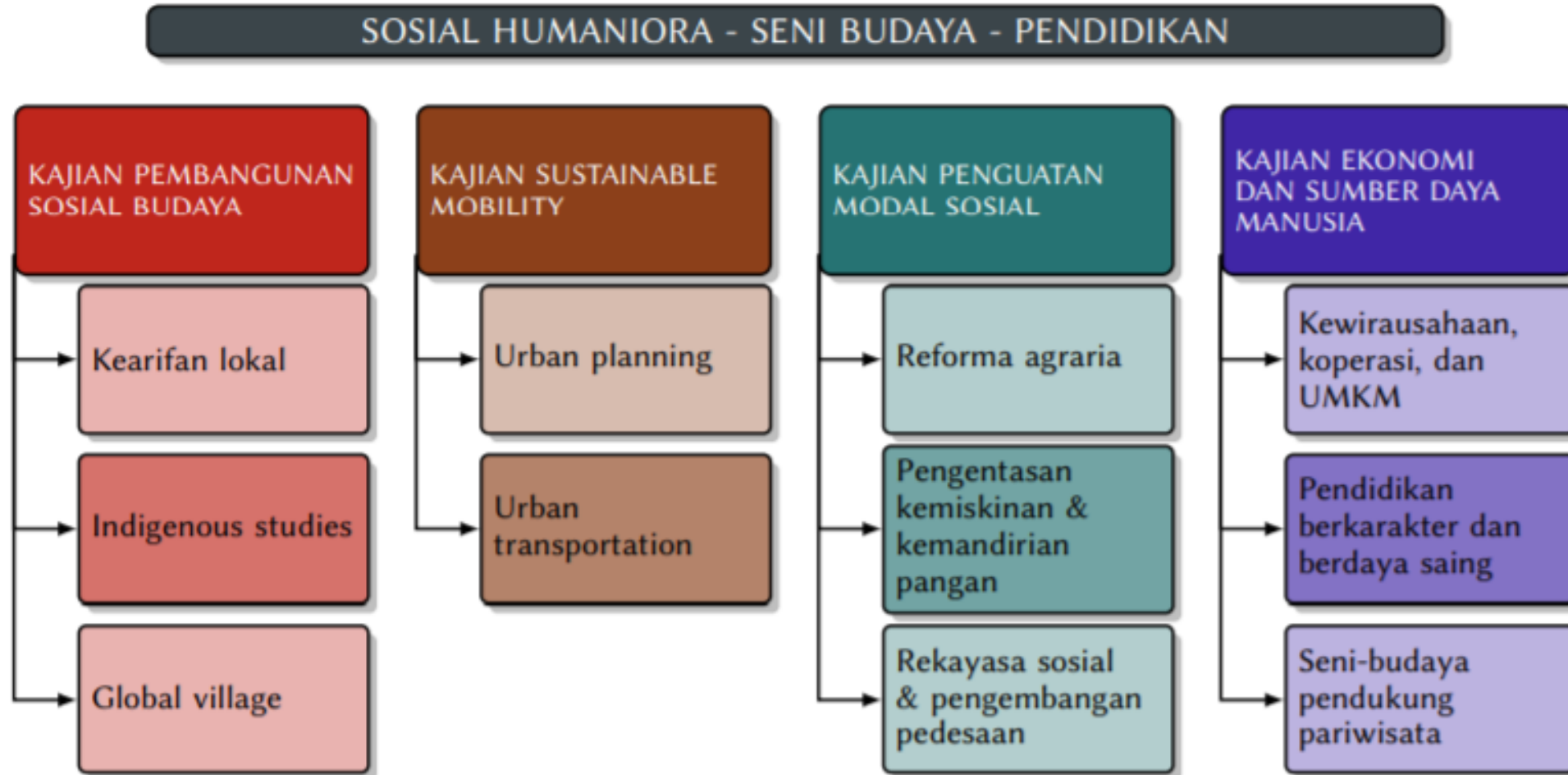
Gambar 4.12: Tema dan topik untuk fokus riset Sosial Humaniora - Seni Budaya - Pendidikan